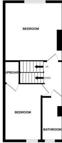
1ST FLOOR 400 sq.ft. (37.1 sq.m.) approx.